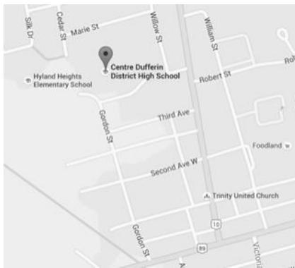
Centre Dufferin DHS Shelburne

Classes in this guide are held at the following locations Call 519-941-2661 for more information