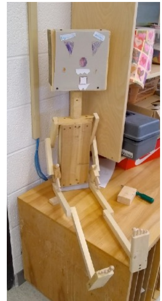
Our Wooden Robot!