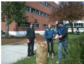
Figure 1 Green Day at GCVI (2005)