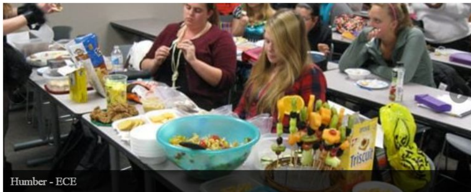
Humber - ECE