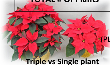
Triple vs Single plant

(PLEASE USE THIS FORM FOR KEEPING TRACK OF YOUR ORDERS. NO NEED TO RETURN THIS TO THE SCHOOL)