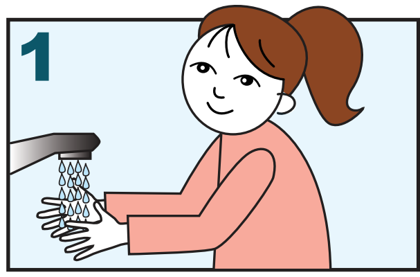
Wet your hands.