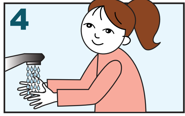
Rinse your hands.