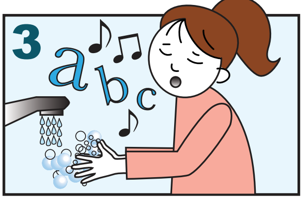
Sing the ABCs.